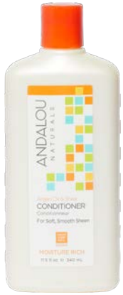
Andalou Naturals Conditioner selected varieties