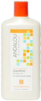
Andalou Naturals Shampoo selected varieties