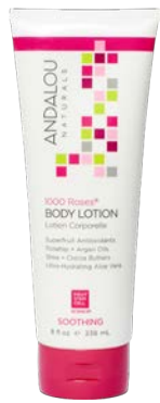
Andalou Naturals Body Lotion selected varieties